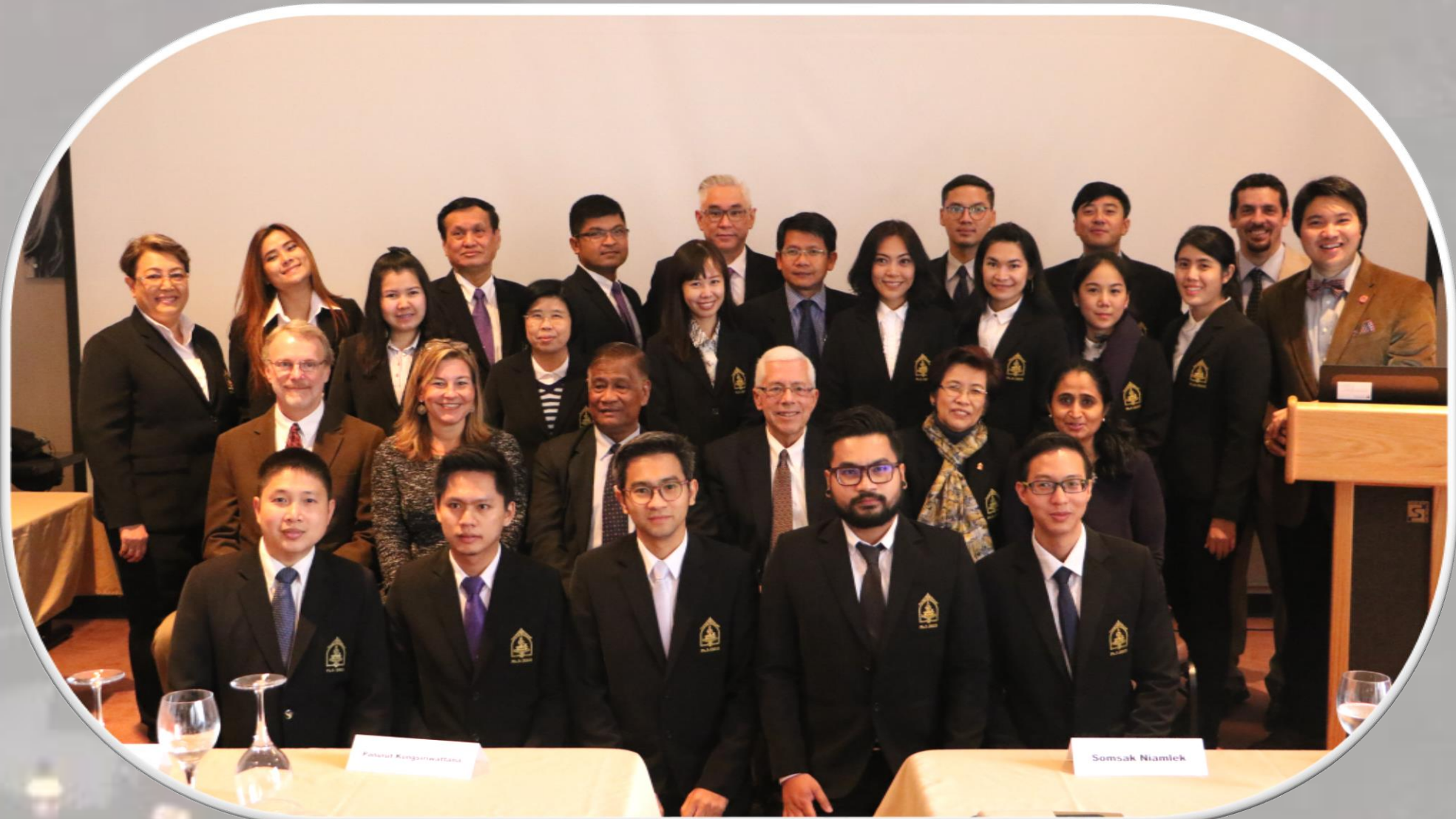
Ramkhamhaeng University, Thailand Participants